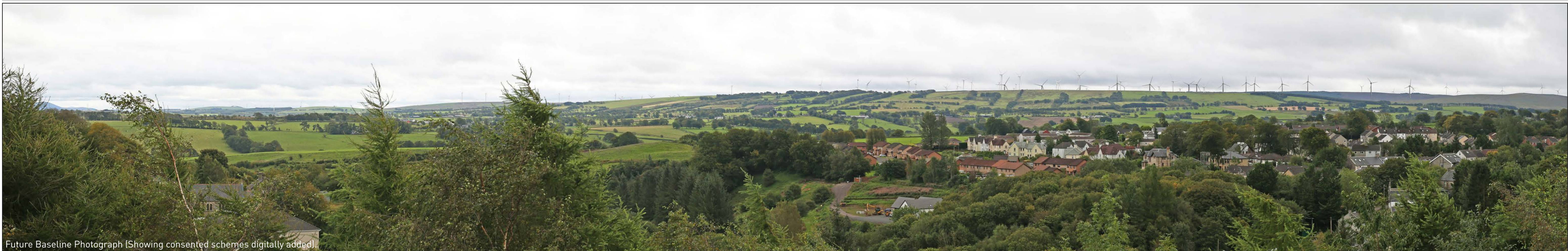
Future Baseline Photograph (Showing consented schemes digitally added)