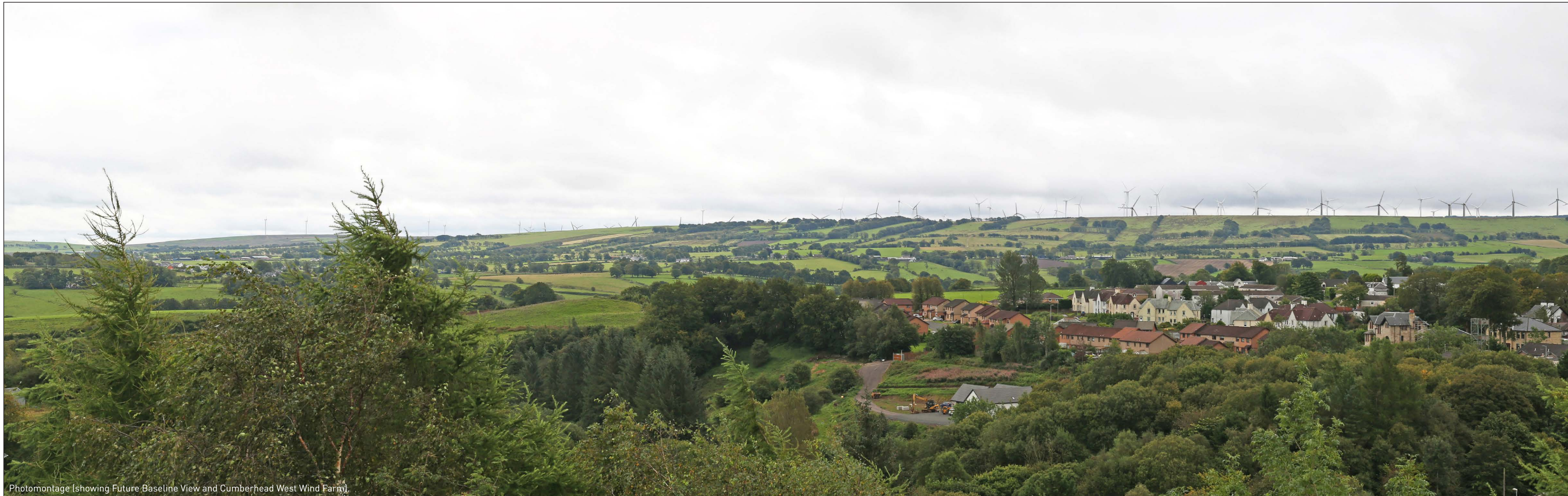
Photomontage (showing Future Baseline View and Cumberhead West Wind Farm).